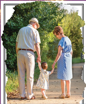
Happy Grandparents Day!

LET US BLESS OUR GRANDPARENTS ON THIS DAY. FOR WITHOUT THEM THERE WOULD BE LESS JOY IN THE HEARTS OF CHILDREN: