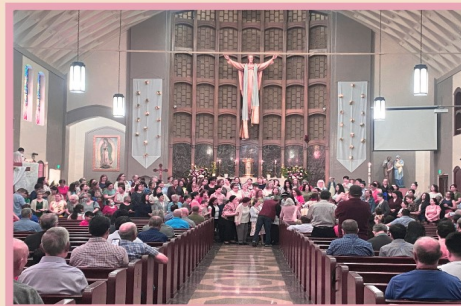
Our beautiful moms receiving a blessing!